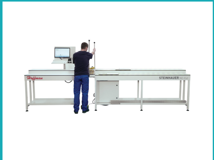
▶ Steinhauer NC-Cut Machine